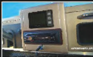
US Made Sevcon Controller

ACG, Inc. Announces another ground breaking change in all of it's 2011 line up of cars. All cars will now feature -