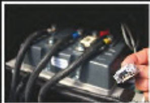
Diagnose Your ACG Car From Anywhere in the world Via The Internet!

Continuous 10.0 hp. Output Better Torque/Better acceleration Full Regenerative Braking Power More efficient - Drive further Safety - anti roll back feature Multi-Function Display